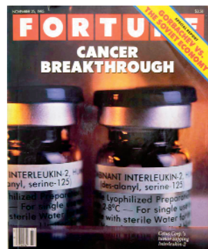
ROLLER COASTER OF HOPE IL-2 on a 1985 cover of FORTUNE.

Gleevec The little yellow pill from Novartis has wondrous effect in a few rare cancers involving simple mutations, although the disease can grow resistant to this “targeted” biological drug.