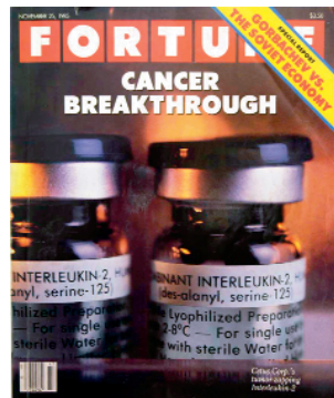
ROLLER COASTER OF HOPE IL-2 on a 1985 cover of FORTUNE.

Gleevec The little yellow pill from Novartis has wondrous effect in a few rare cancers involving simple mutations, although the disease can grow resistant to this “targeted” biological drug.