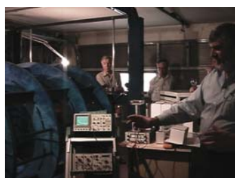
Struttura meccanica e test rilevatori