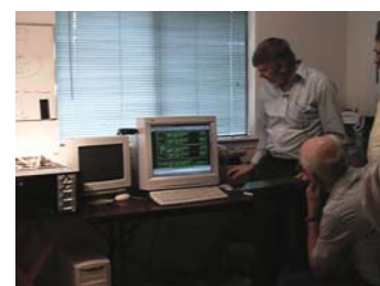
Strumenti software per sviluppo hardw.