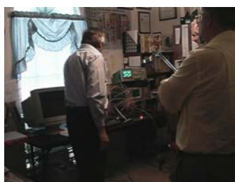
Dimostrazione algoritmo identificazione fotoni